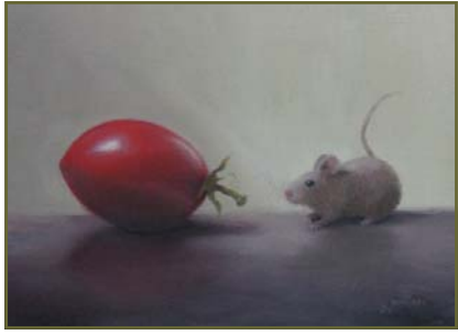
Friend or Foe? , oil, 5" x 7"