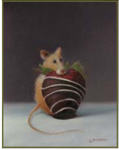
First Taste , oil, 5" x 4"