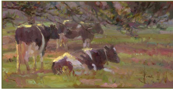
Dairy Pasture, oil, 7" x 14"