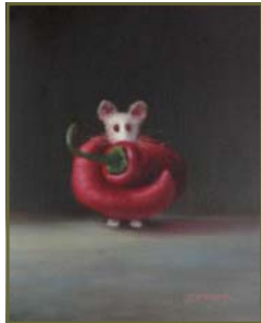
All Wrapped Up , oil, 5" x 4"