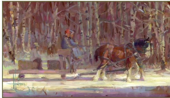
Homeward Bound, oil, 7" x 14"