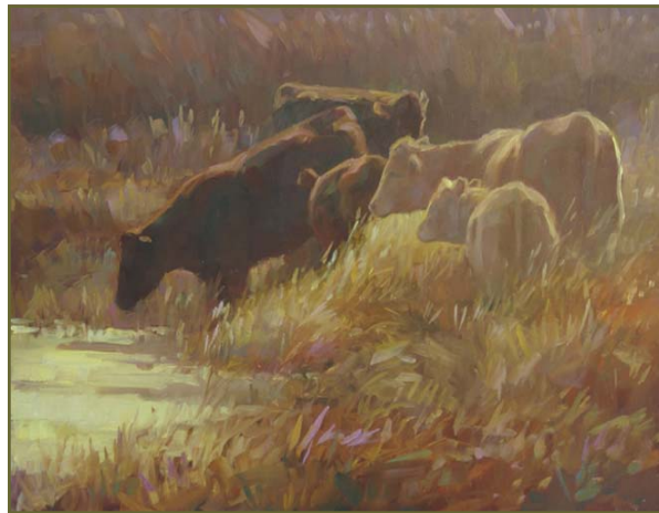
Taking Turns, oil, 18" x 24"