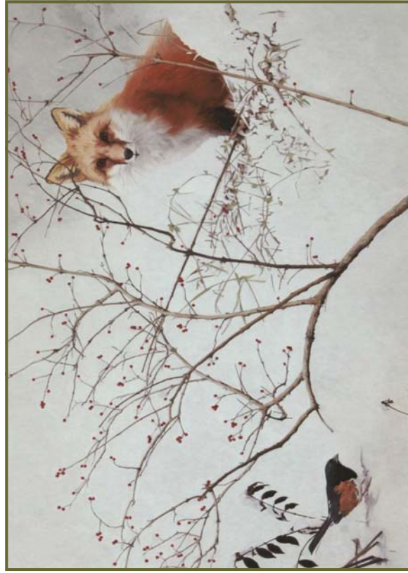
Red Fox with Rufous-sided Towhee by Mark Eberhard, oil, 20" x 30"