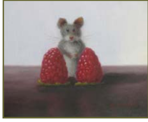
Three Friends , oil, 4" x 5"