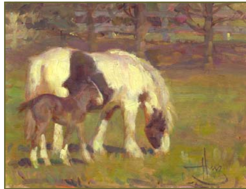
Newest Addition, oil, 8" x 10"