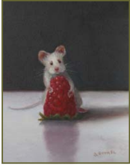
My Raspberry , oil, 5" x 4"