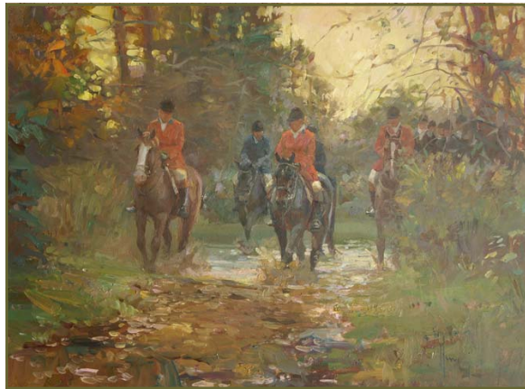
Heading Out, oil, 18" x 24"