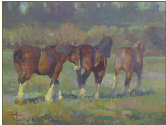
No Hurry, oil, 18" x 24"