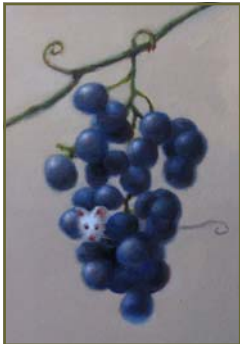
Hide & Seek , oil, 7" x 5"