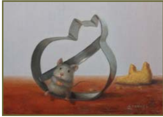
Sweet Revenge , oil, 5" x 7"