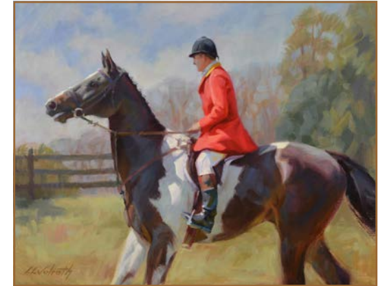
Moving in Harmony by Linda Volrath, American contemporary, oil, 11" x 14"