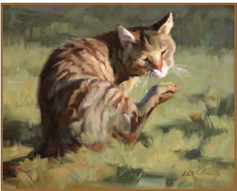
That's the Spot , oil, 8" x 10" by Linda Volrath