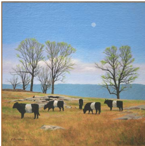
Blue Ridge Bellies, oil, 9" x 9"