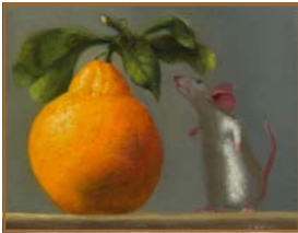
In the Shade , oil, 5" x 7"