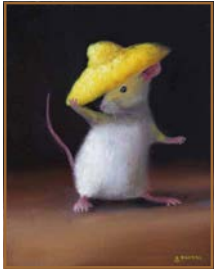
Umbrella by Stuart Dunkel, oil, 5" x 4"