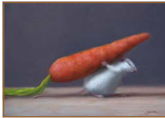
Heavy Prize by Stuart Dunkel, oil, 5" x 7"