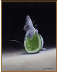
Lime Squeeze , oil, 5" x 4"