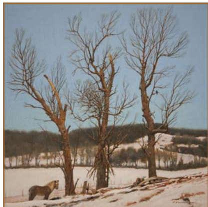
Winter Camouflage, oil, 8" x 8"