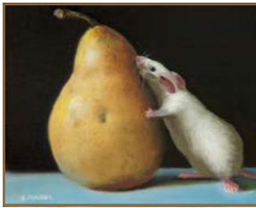
Fortunate Fellow , oil, 4.5" x 5.5"