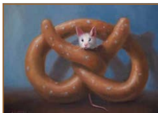
Confused , oil, 6" x 8"