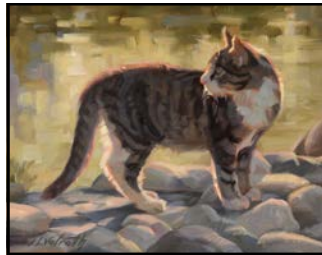
Tabby on the Rocks , oil, 8" x 10" by Linda Volrath