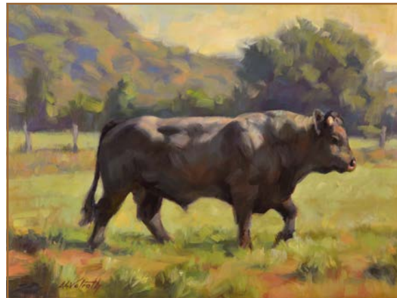
Neighborhood Bully , oil, 12" x 16" by Linda Volrath

COVER: "Dutch Doors" oil, 8" x 8" by Peter Sculthorpe (American/Canadian b. 1948)