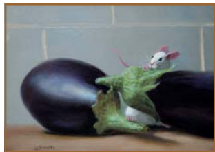
Eggplant Surprise , oil, 5" x 7"