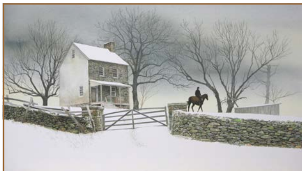
Winter's Cloak, watercolor, 16.50" x 27.50"