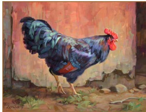
Show Sheen , oil, 12" x 16" by Linda Volrath