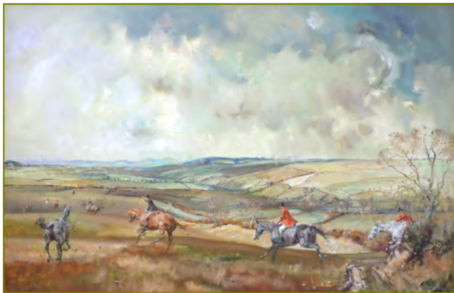
The Cottesmore Over Riddlingham, oil, 24" x 36"