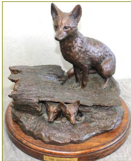
The Sentinel by Marilyn Newmark, bronze # 4/15, cast 1992, edition sold out, 15" round x 14" h. See the fox kits peering out!