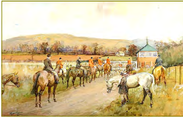
The Old Berks Hunt at Shrivenham Level Crossing, watercolor, 16" x 23"