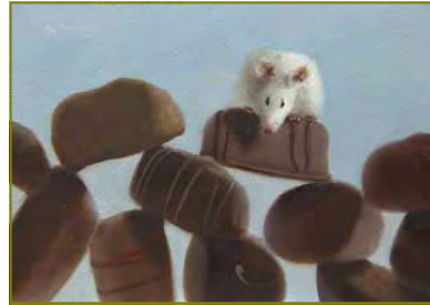
Chocolate High by Stuart Dunkel, oil, 5" x 7"