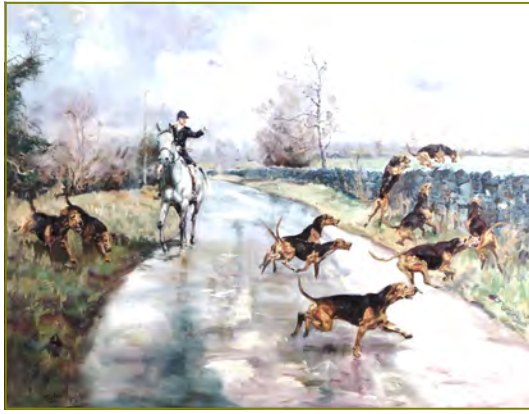
Cheering Them On, The Scarteen, Ireland, oil, 26" x 35"

We have a wonderful selection of work by this extraordinary artist - Please inquire