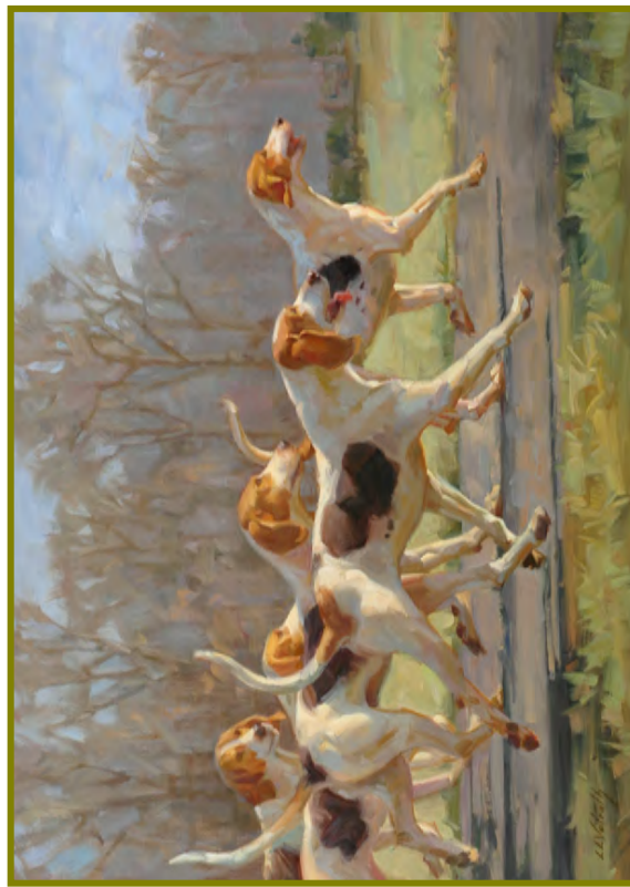
Cruse Control by Linda Volrath, oil, 18 x 24 inches