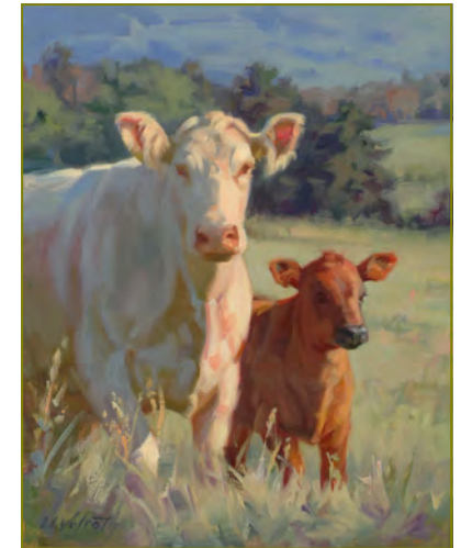
Knee High by Linda Volrath, oil, 10" x 8"