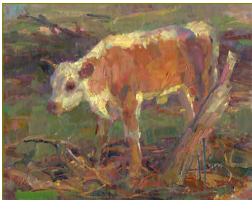
Inquisitive Calf by Valerie Hinz, oil, 8" x 10"