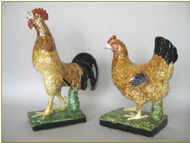
Wonderful Estate Pieces! - Rooster & Hen designed by Rafael Bordallo Pinheiro, (Portuguese, 1846-1905) for the Bordallo Pinheiro Pottery in western Portugal, Majolica style, frog stamp, mid 20th century, 20" x 16" each. Excellent condition