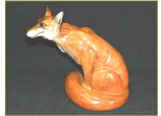
Royal Doulton Porcelain Fox, HN 2634 , 10.5" tall - The largest Doulton Fox & one of the hardest to find, excellent condition